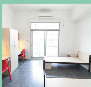
Xing-Da 2nd Village Dormitory